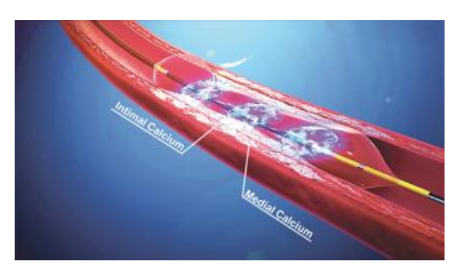
(Left) Our IVL System consisting of a generator, connector cable and IVL catheter. (Right) Our IVL System delivering lithotripsy directly to a calcified vessel

Our IVL System includes a generator, connector cable and a variety of IVL catheters designed to treat PAD and CAD. Our IVL System employs our IVL Technology to crack calcium through short, microsecond bursts of sonic pressure waves, which are generated within the IVL catheter, travel through the vessel and crack calcium with an effective pressure of up to 50 atmospheres ("atm") (a unit of pressure) without harming the soft tissue. Our IVL catheters utilize multiple lithotripsy emitters that are integrated into a standard, semi-compliant balloon-catheter platform. The IVL catheter is advanced to the target lesion and the integrated balloon is inflated with fluid at a low pressure to make contact with the arterial wall. IVL is then activated through the generator with the touch of a button, creating a small bubble within the catheter balloon which rapidly expands and collapses. The rapid expansion and collapse of the bubble creates sonic pressure waves that travel through the vessel and crack the calcium, allowing the blood vessel to expand under low static pressure.